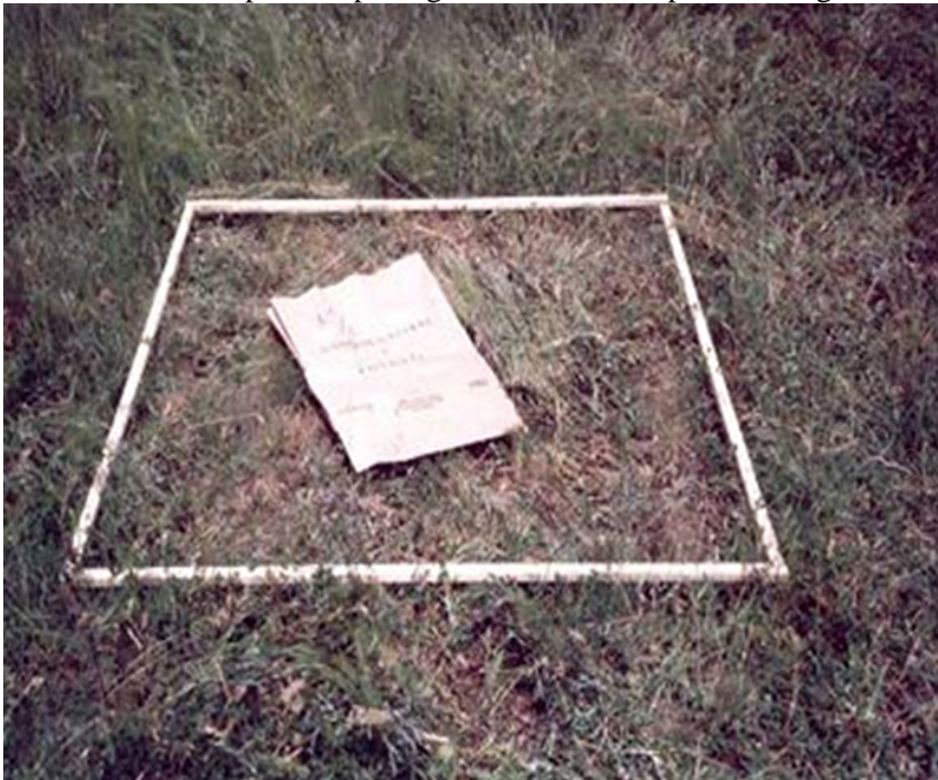
Figure 1. The quadrat for determination the number of plant species.

Investigations of the floristic composition were carried out over the 2017 growing season. Sampling of plant species and green matter yield determination was carried out at the optimum plant growth and developmental stage.